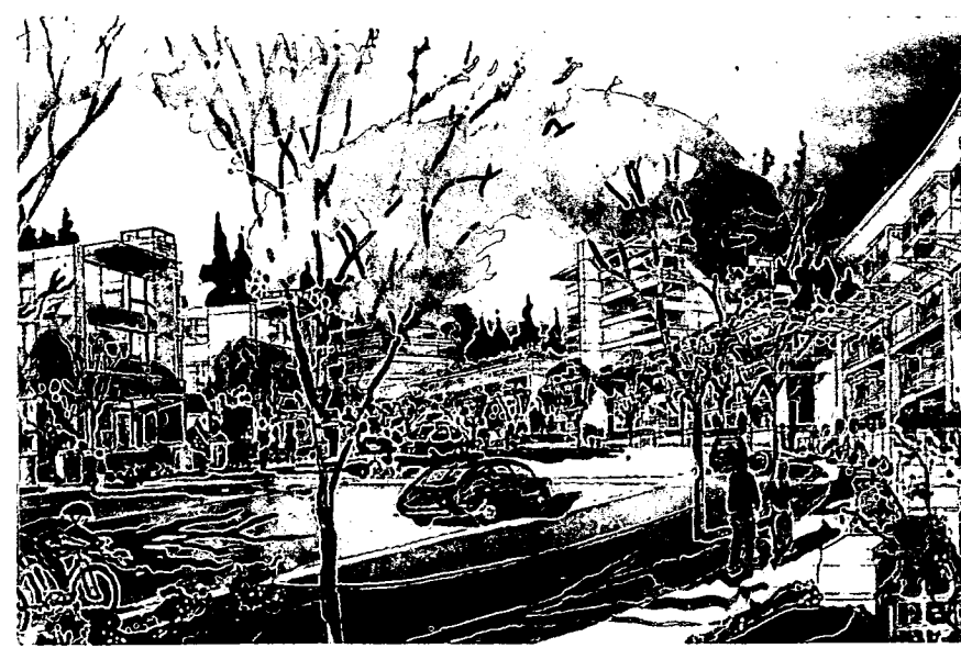
A View Along University Crescent

A major underlying objective is to respect and complement the natural heritage of Burnaby Mountain, thus protecting ecosystems and ecological functions in a manner that will reflect positively on the University. Special attention is being given to the protection of significant trees, streams, and wildlife. In addition 29 acres will be set aside within the Ring Road as Naheeno Park. These measures are set out as requirements in the Official Community Plan, which was drafted within the context of environmental stewardship.